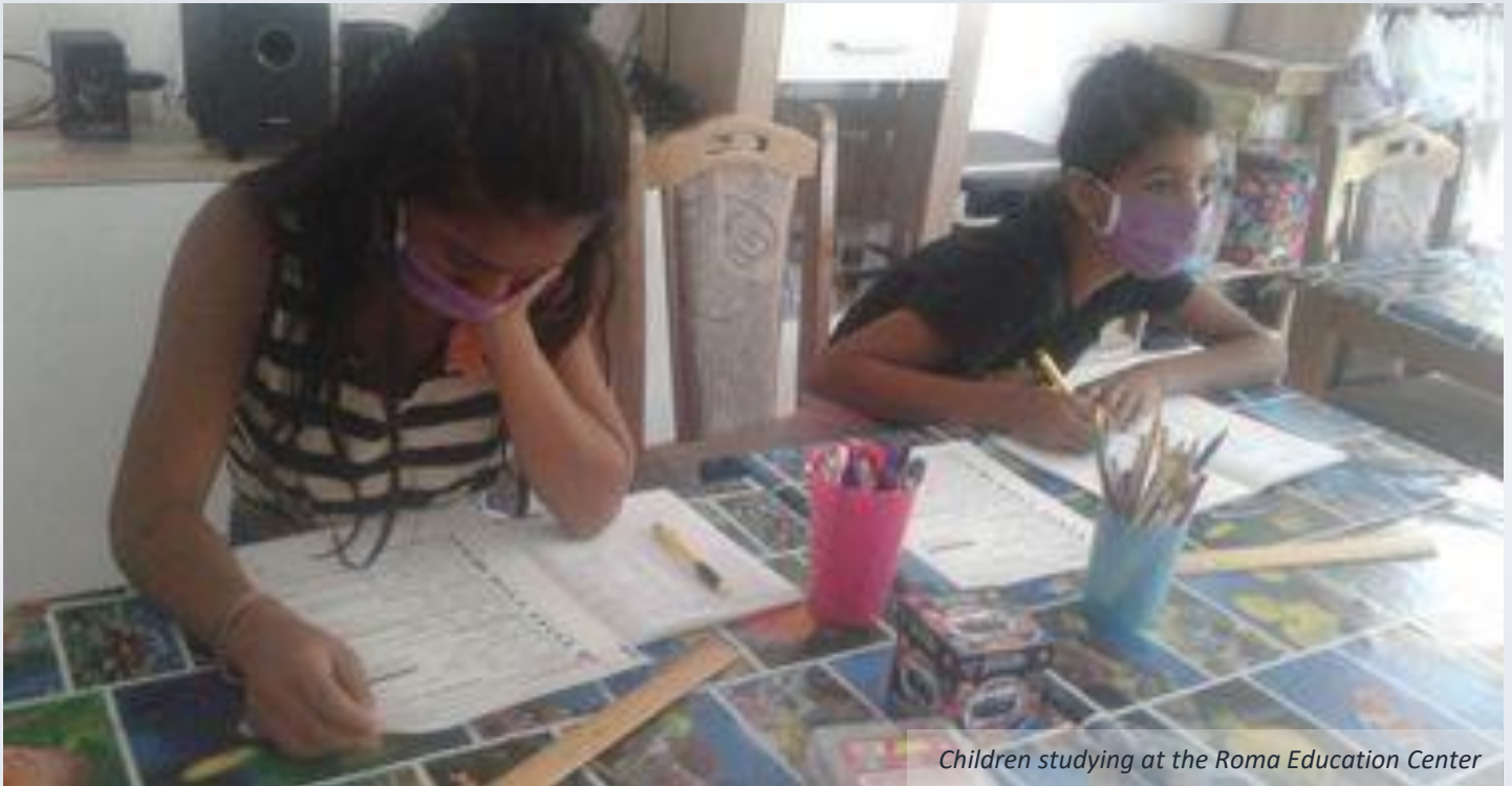
Children studying at the Roma Education Center